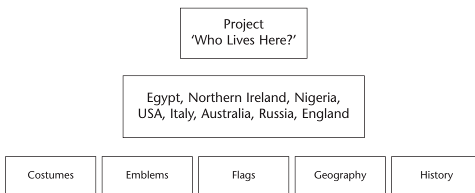
Figure 1: Topics researched

The next stage of the project involved children researching the historical and geographical backgrounds of the countries from which identified families had come. Pupils worked in groups of three or four, deciding on which country they wished to gather information about and on what aspects. Much of the research was done using the internet. We set aside one hour per day when pupils accessed the classroom computers and the school computer room. However, much of this work was done by the pupils after school, meeting in their respective homes. Figure 1 highlights the topics which pupils researched at this stage.